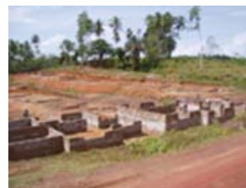
Foundations for all 50 houses are now completed.