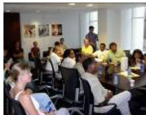
After a great Sri Lankan feast each group presented their work to the satisfied designers ...

MnSLFF is a registered 501(c)(3) organization with Tax ID No. 11-3737913