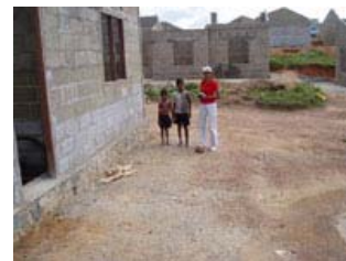
During her last visit to the construction site Jayani met with some children ...